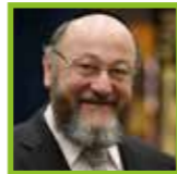
Ephraim Mirvis Chief Rabbi

"Mitzvah Day is an excellent example of how Jewish values are harnessed for the benefit of all communities. Whether it be providing food to those who need it or reaching out to those experiencing social isolation and loneliness, all these acts of kindness, no matter how small, are significant and will be appreciated."