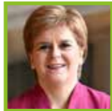
Nicola Sturgeon First Minister of Scotland

"I want to pay tribute to the incredible work being done by Mitzvah Day to encourage us all to give our time to help others. This day is a wonderful opportunity to see people of different faiths working together to enrich their local communities."