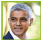
Sadiq Khan Mayor of London

"Mitzvah Day shows the very best of our Judaism in action – as we unite with those of all faiths and none to do something for those who need it most. Mitzvah Day has become such an important part of our calendar that it's hard to remember a time when it didn't exist."