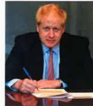
THE PRIME MINISTER