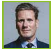
Sir Keir Starmer Leader of the Opposition

"I want to pay tribute to the incredible work being done by Mitzvah Day to encourage us all to give our time to help others. This day is a wonderful opportunity to see people of different faiths working together to enrich their local communities."